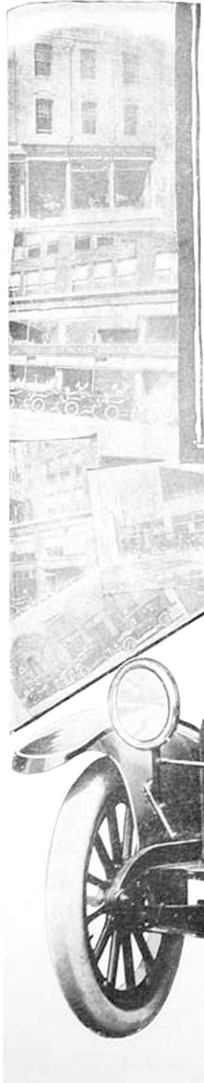
Studebaker SIX $1385

You who are buying a car may well consider the judgment of these 3,000 and more merchants whose knowledge of automobile values is their business asset.