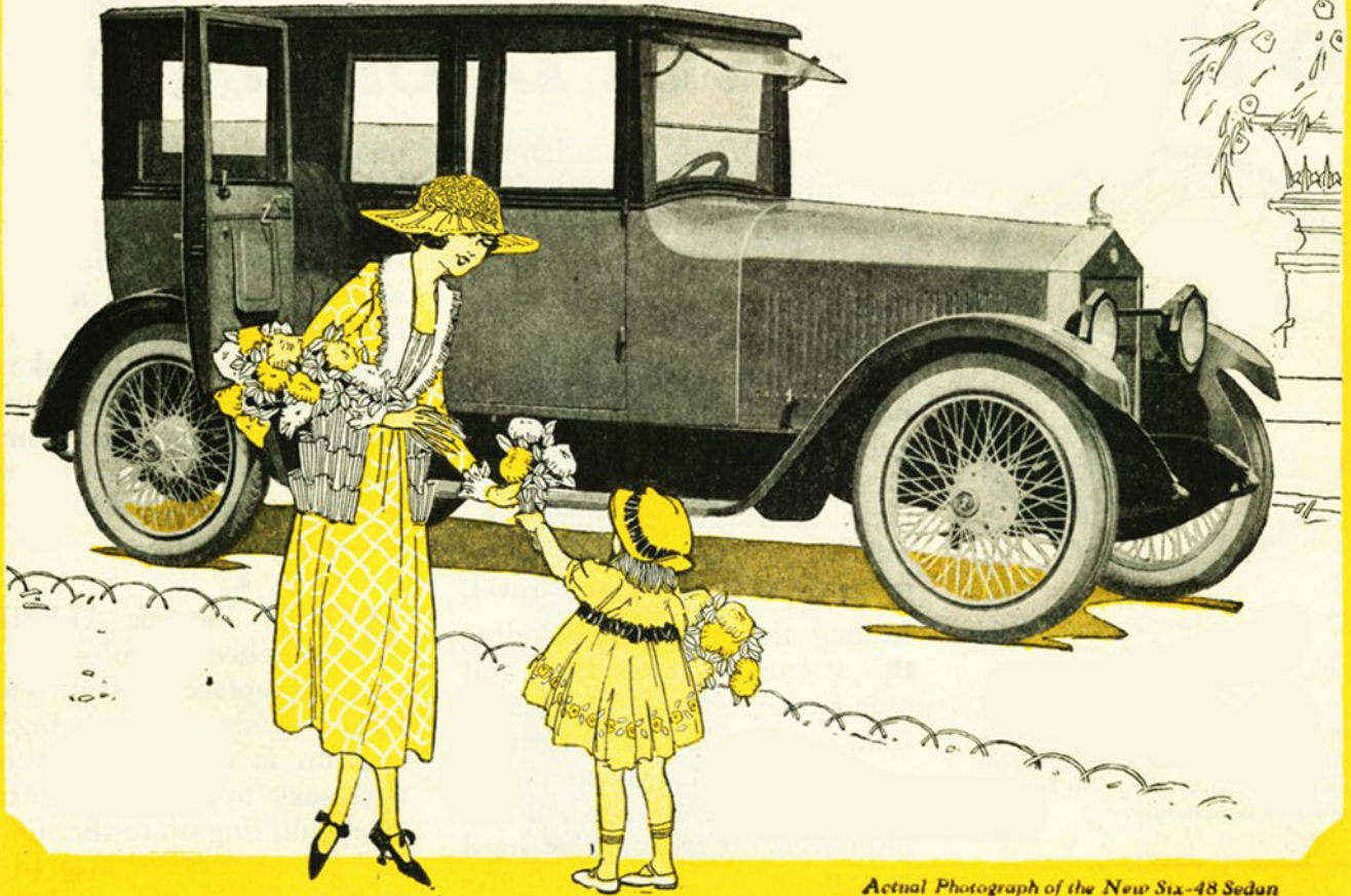
Actual Photograph of the New Six-48 Sedan

The Moon is an embodiment of the highest degree of engineering skill. Each unit is the work of part specialists who have attained outstanding leadership in their particular field. No single organization could embrace all these specialists, but Moon engineers have combined the skill of all in a distinctly individual car that is priced within the realm of reason.