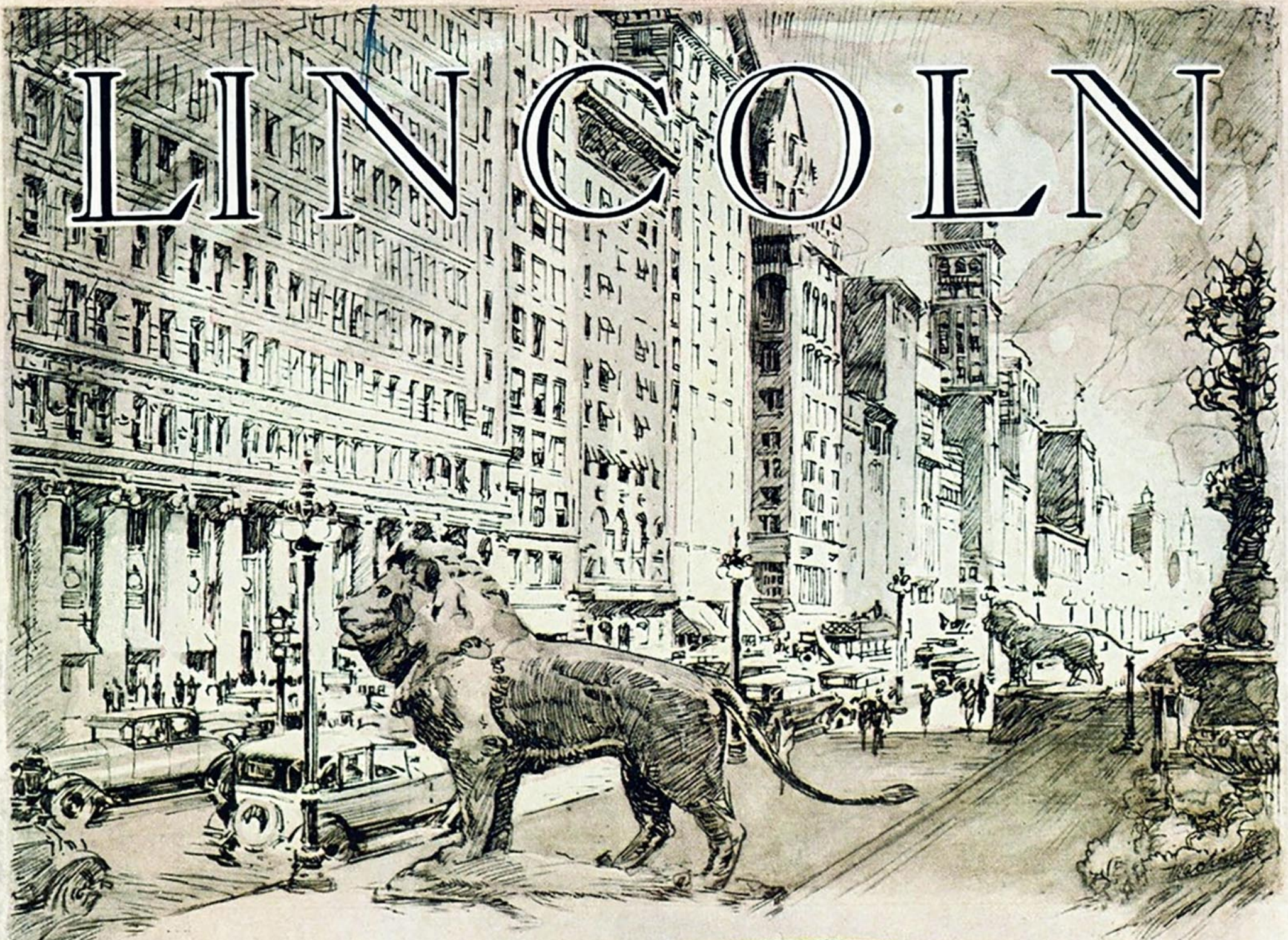
The Lincoln on the Boulevards of the World Michigan Ave. Chicago