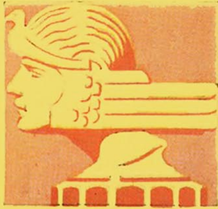
The Symbol of Safety

Stutz Motor Car Co. of America, Inc. • • Indianapolis