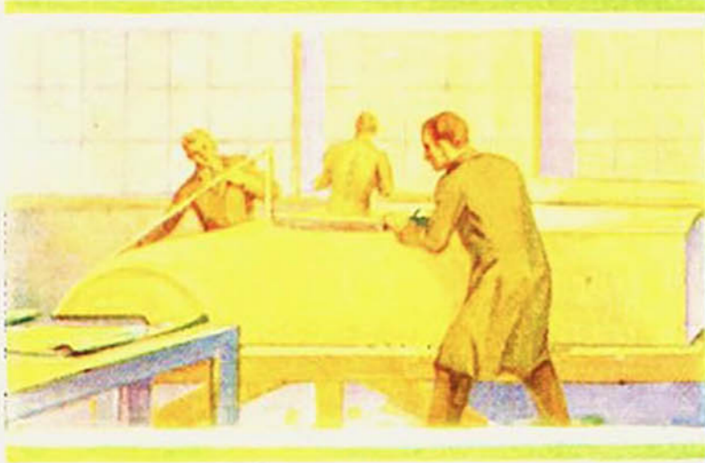
The elaborate figure-heads of famous American clipper ships were not cut from solid timber, but built up of fitted pieces—then carved to final form