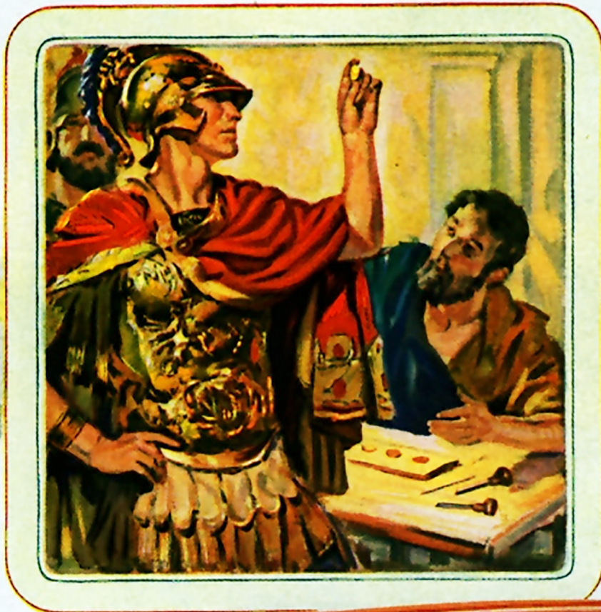
Greek artists depicted Hercules and Zeus on the dies cut to strike the gold coins of Alexander's world empire (300 B. C.)