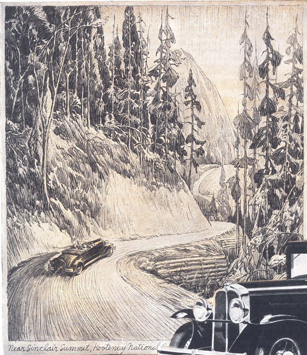
Near Sinclair Summit, Kootenay National Park