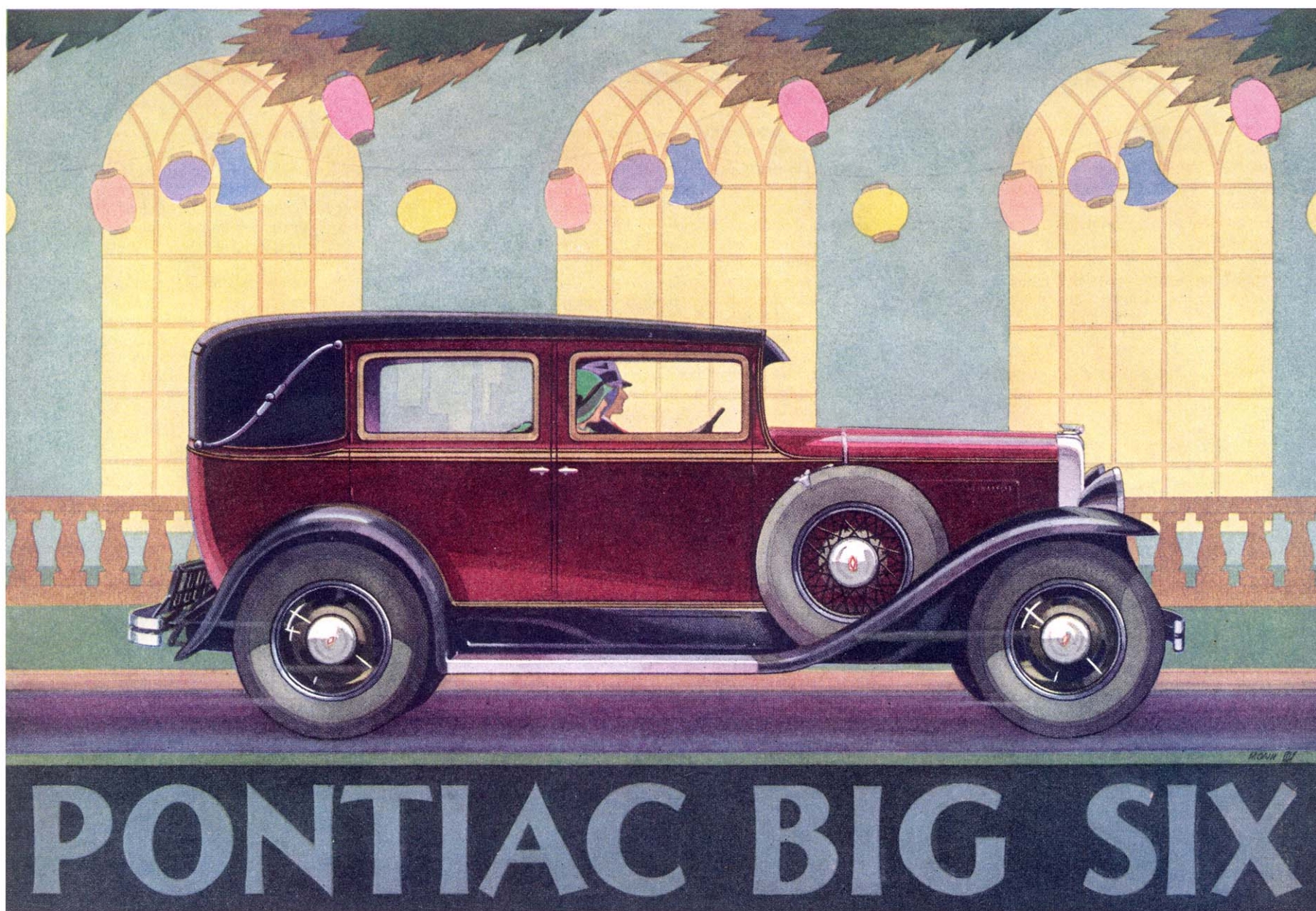
The 4-Door Sedan • Body by Fisher