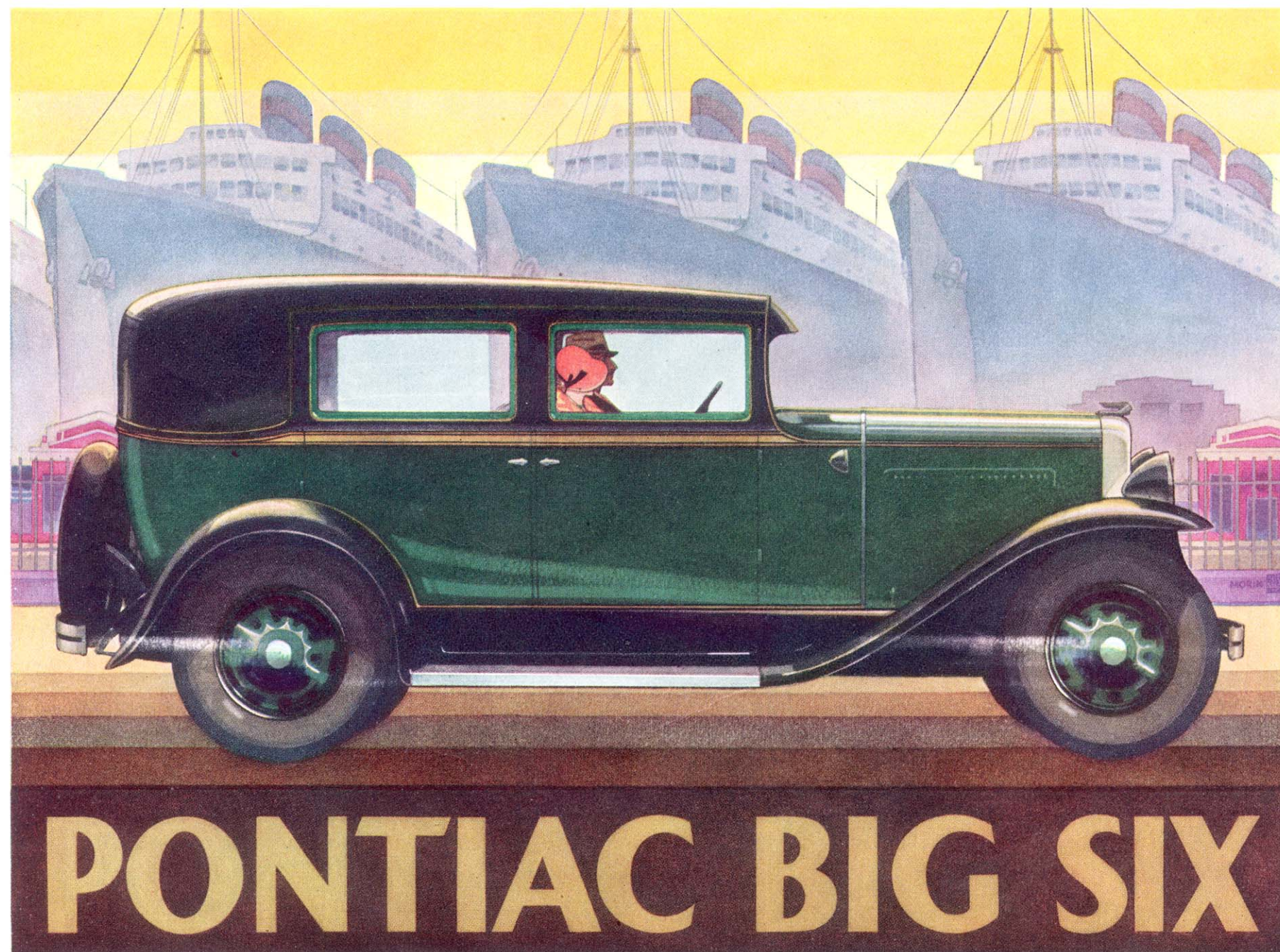
The 4-Door Sedan • Body by Fisher