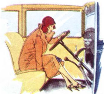
A few turns of the convenient handle and the driver's seat is adjusted for your greatest comfort.

WE ARE grateful to the alert young matron who so concisely expressed this opinion of her Pontiac: “It is so smart, safe, luxurious—yet so sensibly economical.” In ten words, she crystallized what thousands upon thousands of progressive American women have learned about this automobile by driving it.