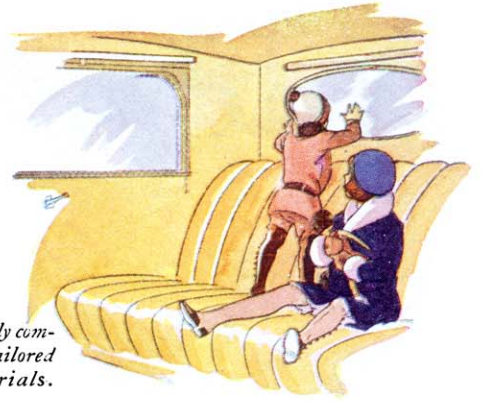
Tonneaux are spacious, luxuriously comfortable. Upholstery is smartly tailored of durable, beautiful materials.