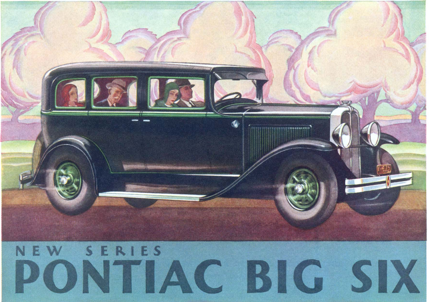
Illustrated above: The Custom Sedan - Body by Fisher