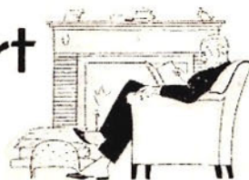
Hudson and Essex Comfort is Like Your Favorite Fireside Chair

Now you can ride in Comfort and save money too!