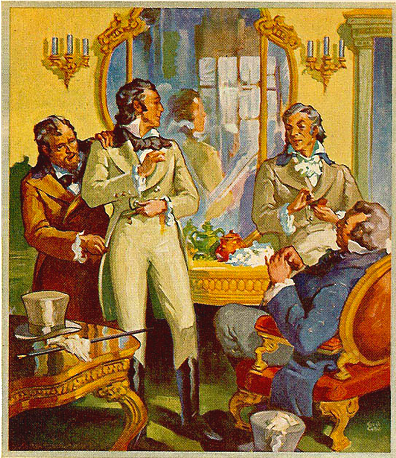
The patronage of Beau Brummell, that famed exquisite of the 18th century, led his crony, the Prince of Wales, and the nobility of all England to the salon of the great Schweitzer, to whom the cut of a coat was a fine art