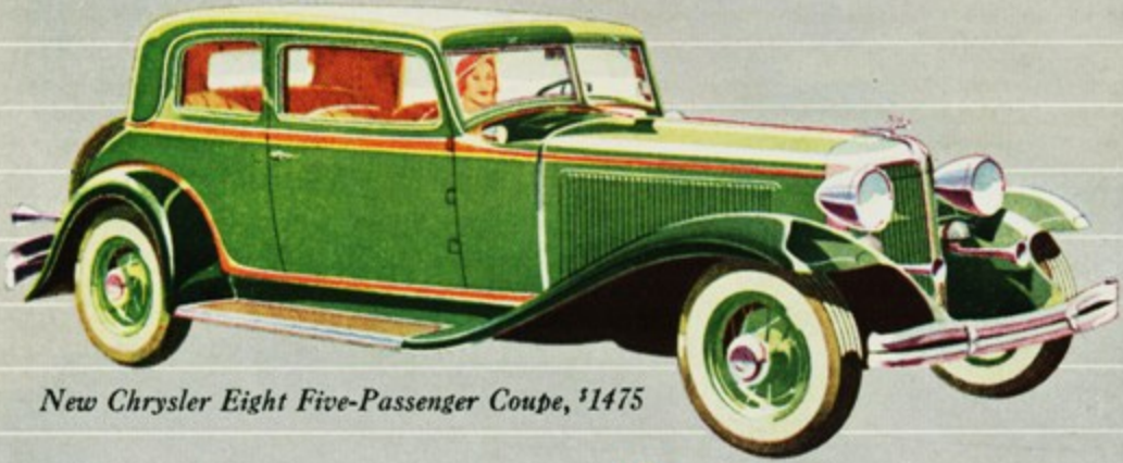
New Chrysler Eight Five-Passenger Coupe, $1475

AUTOMATIC CLUTCH • SILENT GEAR SELECTOR • FREE