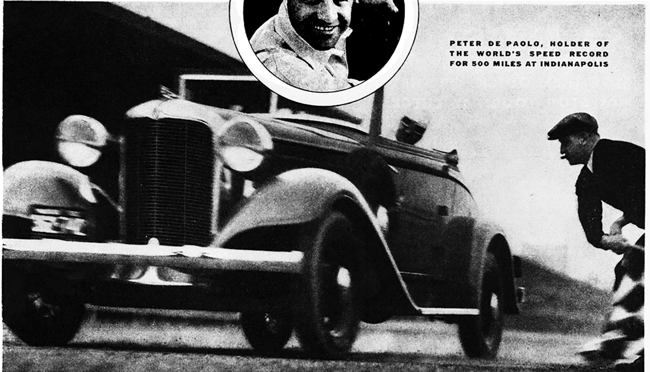
PETER DE PAOLO, HOLDER OF THE WORLD'S SPEED RECORD FOR 500 MILES AT INDIANAPOLIS