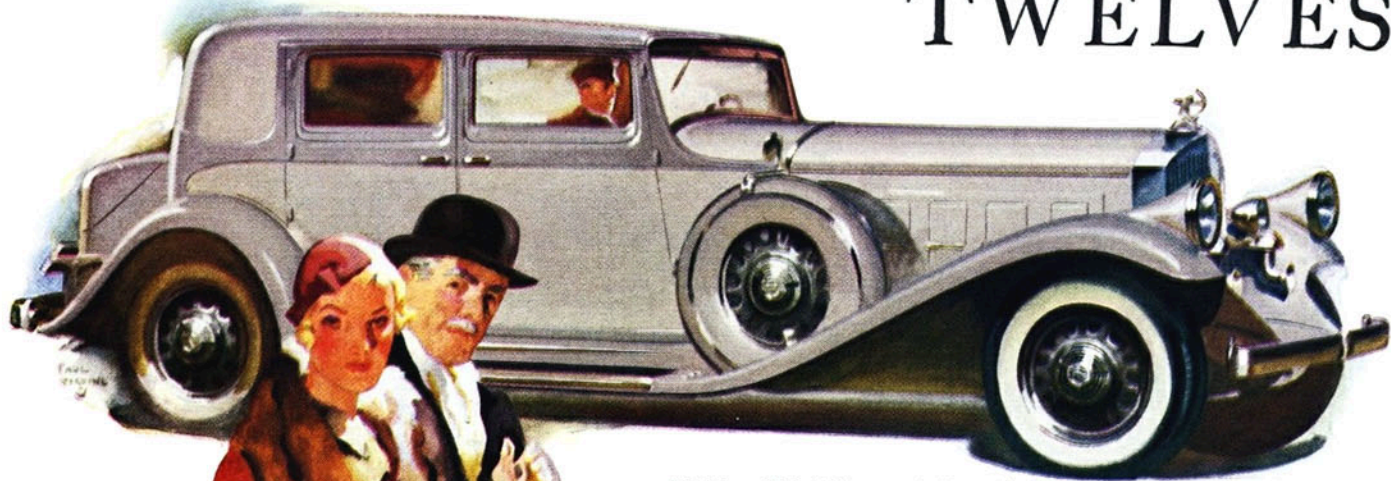
Model 53 Club Sedan . . . $3650 at Buffalo (Special Equipment Extra)