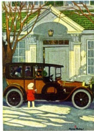
THE Pierce-Arrow gallery of portraits is an envied institution. It evidences a finer, longer lineage than that of any other motor car in America. Here are shown models of 1915 and 1932.

Even when it is running with whisper-silence on the dynamometer, Pierce-Arrow experts may dismantle and reconstruct it to correct some microscopical irregularity. And the superb appearance and performance of the new Pierce-Arrow Twelves and Eights brilliantly justify this singular lavishness of skill and time and care.