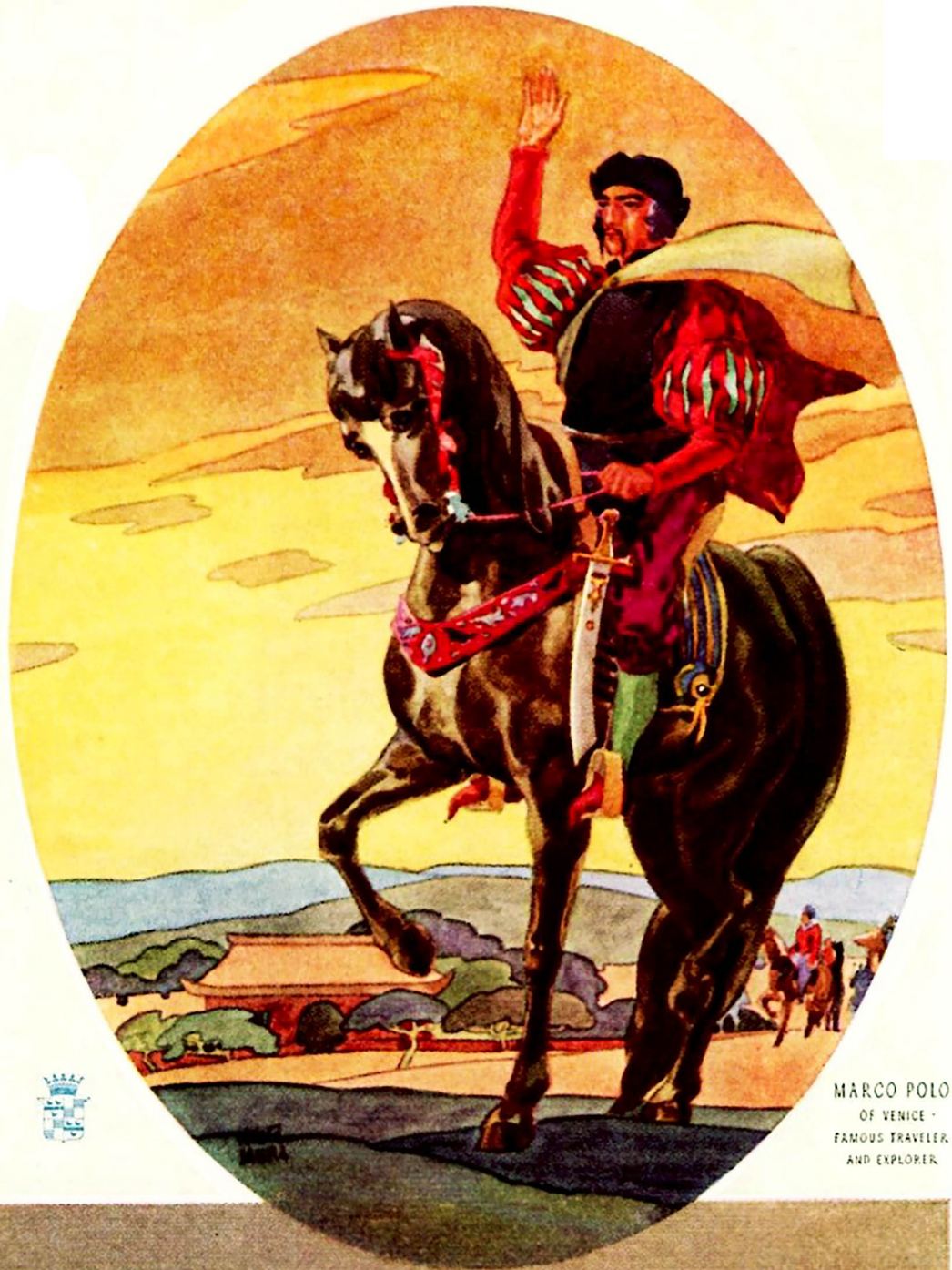
MARCO POLO OF VENICE - FAMOUS TRAVELER AND EXPLORER

Nowhere has Cadillac's leadership been more consistently maintained than in the design and construction of its engines. . . . Nineteen years ago, Cadillac committed itself to the V-type engine principle by introducing the first 90-degree V-type power plant ever used in an automobile. During all the years since, Cadillac has held to this principle without a single interruption—and has become, by virtue of this experience, the acknowledged authority on the V-type engine. . . . This fact becomes of the utmost significance when it is recalled that engines with more than eight cylinders are impractical with any other design. Thus, in the multi-cylinder field, Cadillac obviously stands alone in its ability to design and construct power plants. . . . You sense this leadership the moment you drive a modern Cadillac or La Salle. For in no other cars are the engines so smooth, so quiet, or so generally satisfactory in their performance. La Salle list prices begin at $2245, Cadillac at $2695, f. o. b. Detroit. Liberal G. M. A. C. terms may be arranged on any model.