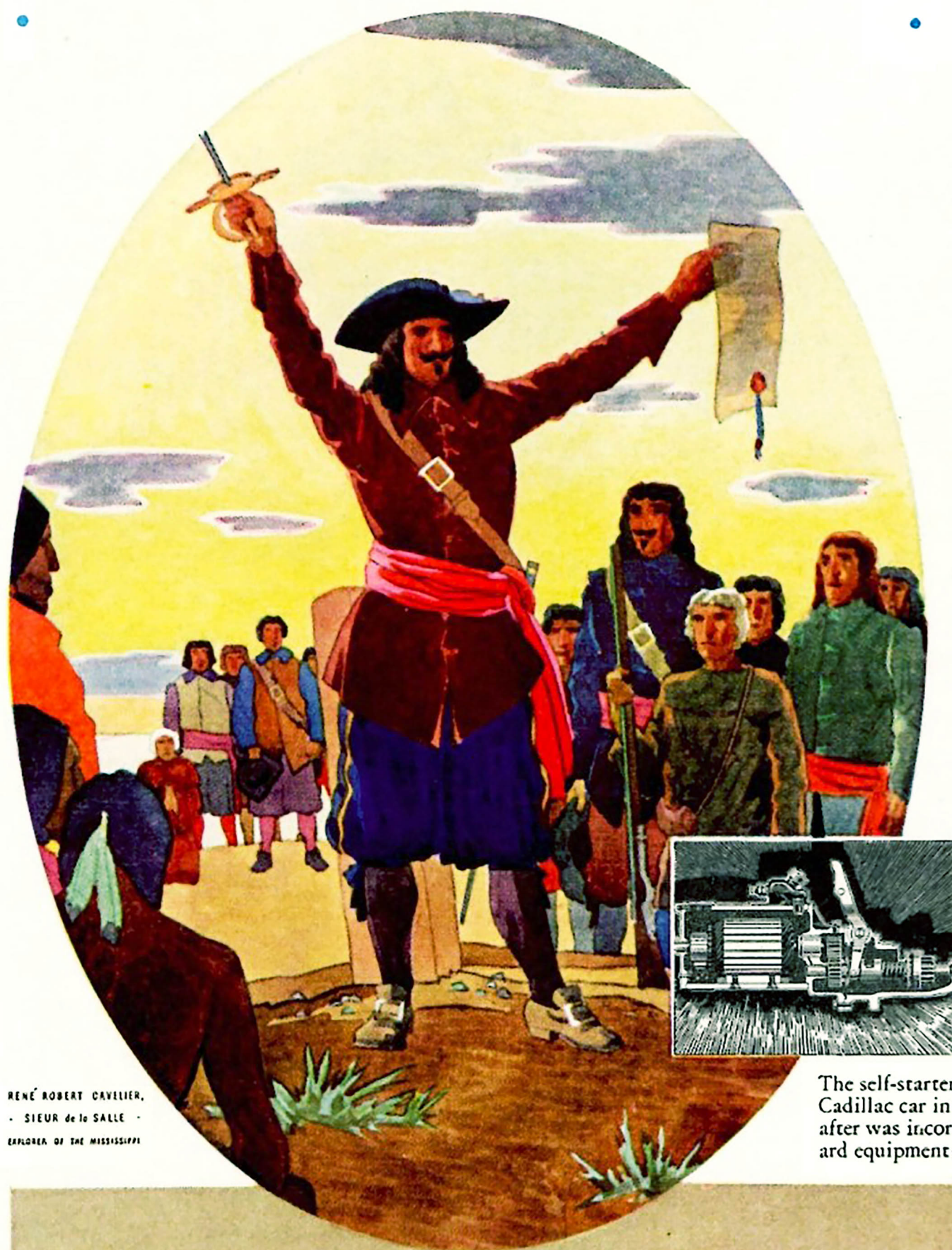
RENÉ ROBERT CAVELIER, - SIEUR de la SALLE - EXPLOER of the MISSISSIPPI

If there is one basic advancement which has had more to do with the success of the automobile than any other—that advancement is undoubtedly the self-starter. And, as has been the case with so many other fundamental improvements in the motor car, the self-starter was a Cadillac achievement. Not only did Cadillac introduce the self-starter, but it perfected it as well—and gave it to motordom as a never-ending source of convenience and satisfaction. . . . This is but a typical example of the pioneering which has carried Cadillac to world dominance as a motor car builder—and which is so admirably exemplified in today's great Cadillacs and La Salles. In their Fisher No Draft Ventilation, individually-controlled; their sensitive full-range ride regulators; their eight, twelve and sixteen cylinder engines; and their marvelous comfort and performance—the new Cadillacs and La Salles are in the finest tradition of Cadillac leadership. . . . These distinguished cars are now on display throughout America, and you are cordially invited to appraise them at any time. La Salle list prices start at $2245, Cadillac at $2695, f. o. b. Detroit.