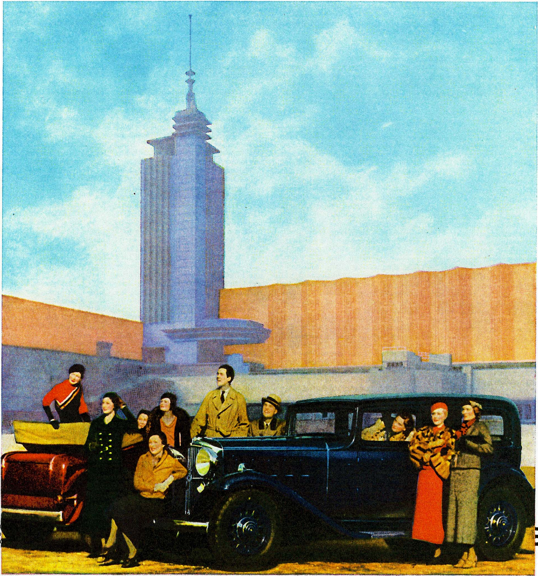
In the background—Hall of Science, Century of Progress International Exposition, Chicago, 1933