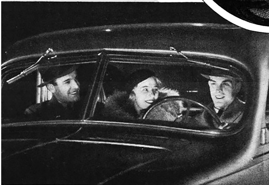
Three's no crowd in De Soto's front seat. It's just as wide as the back. It holds three as easily as a conventional front seat holds two.

And here's how everybody rides luxuriously "amidships" in the new AIRFLOW De Soto. No more "straphanging" from now on!