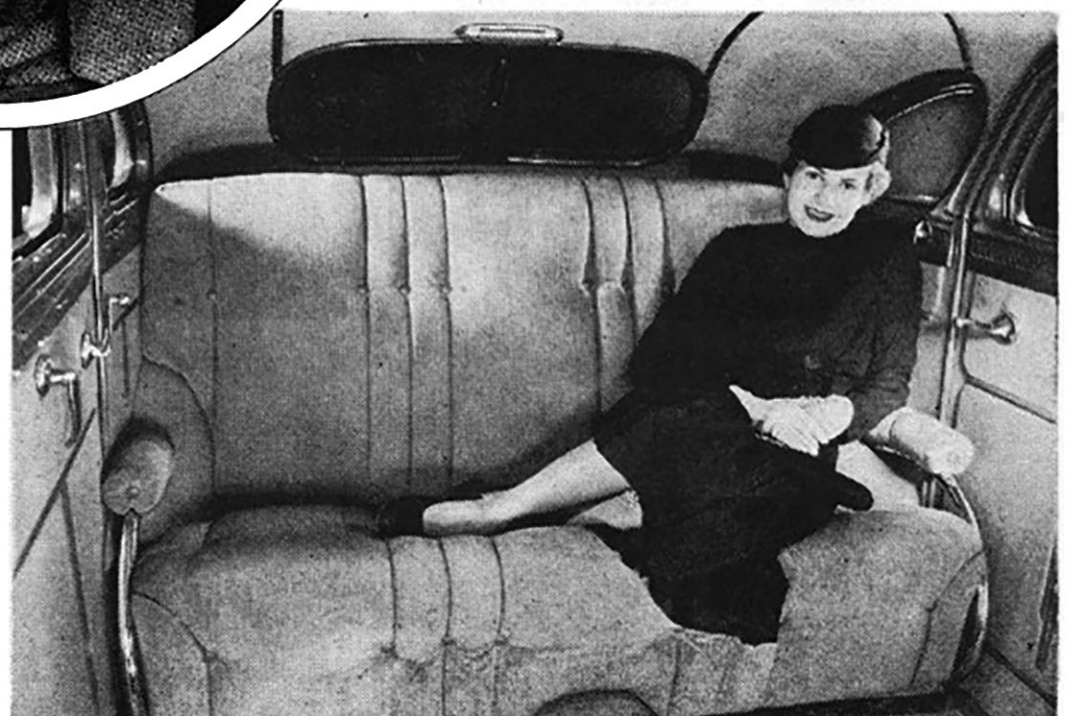
Did you ever see an automobile with so much room in it? Easily accessible behind the back cushion is a large luggage compartment.