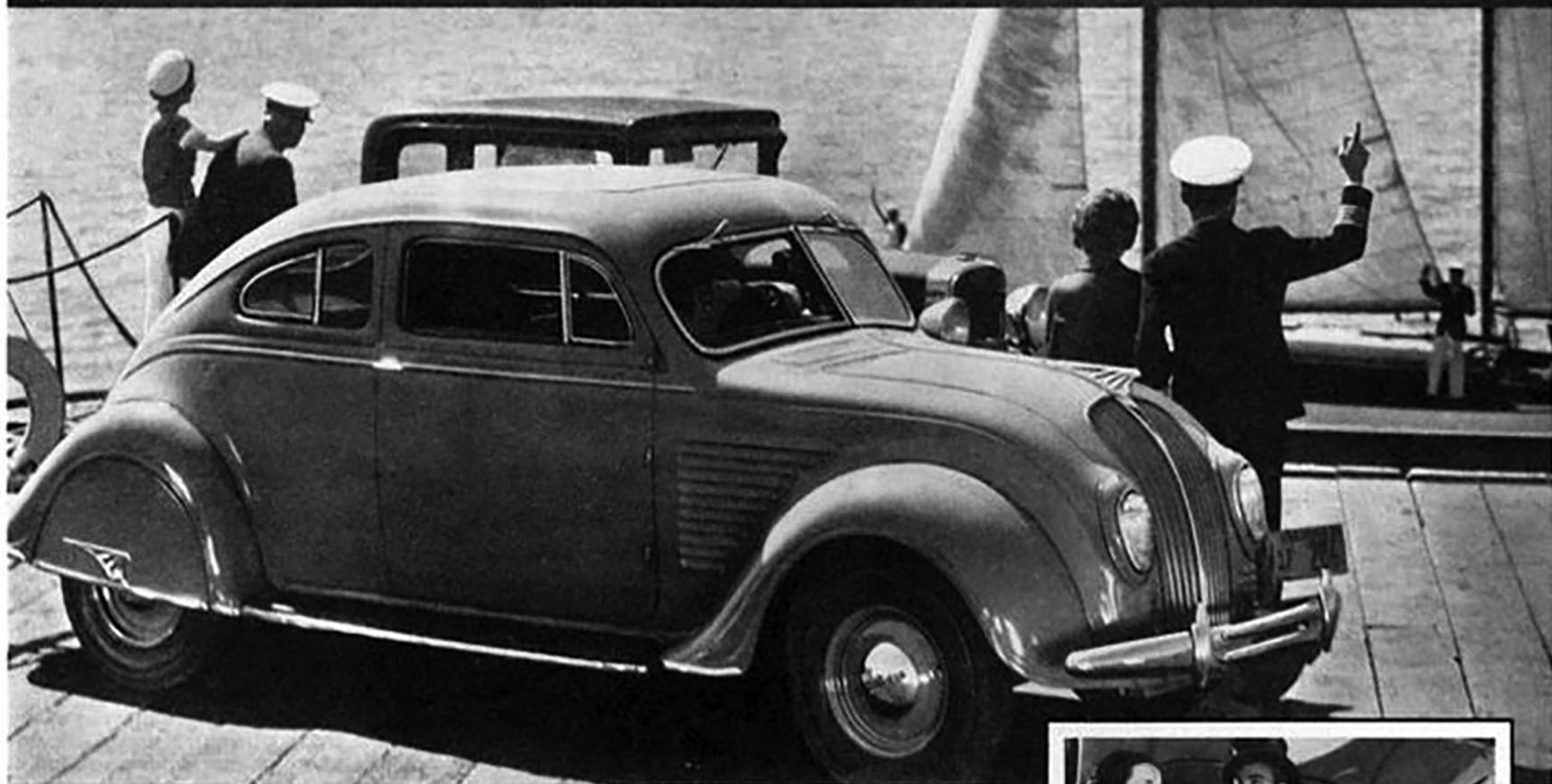
Illustrated above is the AIRFLOW DE SOTO Coupe