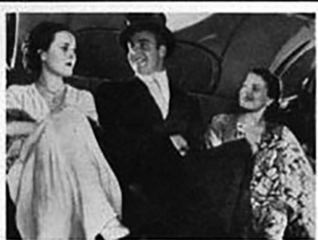
A Back Seat as roomy and comfortable as a Divan... and a Front Seat every bit as wide!

Your first trial trip will show you what this means. No more bouncing or swaying. Go as fast as you please... you can read, write and