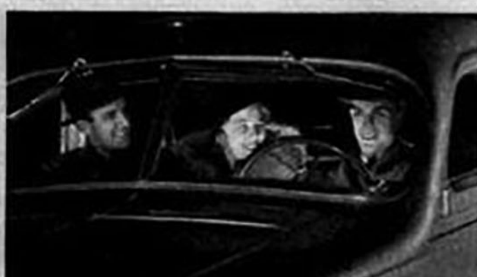
You'll appreciate De Soto's front seat. It holds three comfortably . . . in fact it's as wide as the back seat!