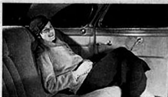
Now, for the first time, you can safely lean back and relax at any speed . . . over any kind of road!

Don't buy a new car that will soon be out of date. Go to your local De Soto dealer today. Ask him to let you drive this sensational new kind of car.