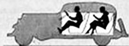
This diagram (above) shows how you ride in a conventional car. Pity the passengers riding over the back axle!

Notice, too, that the 100-H. P. Aluminum Head engine has been moved forward. This permits all passengers to ride between the axles. The result is a new distribution of weight, which does more than all the