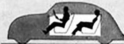
Now see how you ride in the AIRFLOW De Soto. All the passengers sit comfortably "amidships."

new springs in the world could possibly do alone, to increase your comfort.