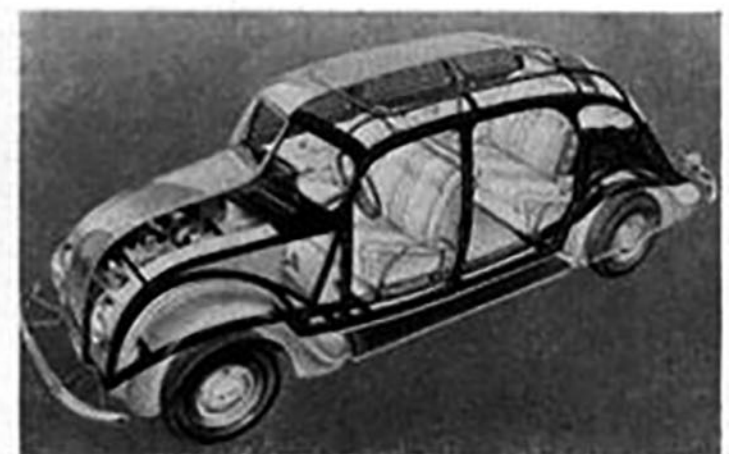
This is a model of De Soto's all-steel unit-frame-and-body. It is 40 times more rigid than the ordinary type. It means greater safety than ever before.