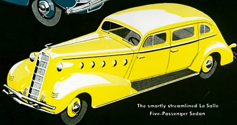
The smartly streamlined La Salle Five-Passenger Sedan

and TODAY'S CADILLAC AND LASALLE CARS ARE FINER VALUES THAN EVER