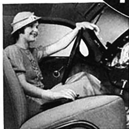
THE STEERING WHEEL is at an easy, racing car angle. There's 25% better vision through a wider windshield.