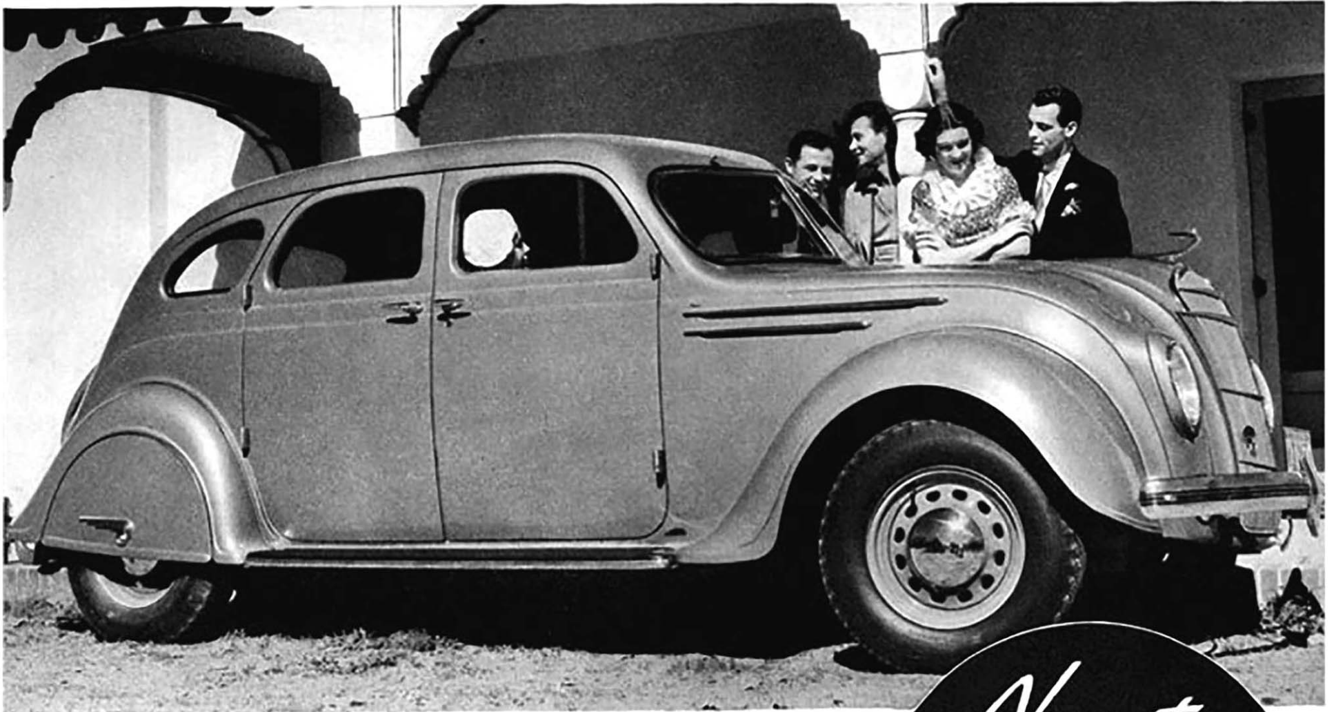
EVERYONE ADMIRES Airflow's modern beauty . . . its amazing roominess for six. Now Only $1015.*

Only Airflow Owners Know motoring's Greatest Thrills!