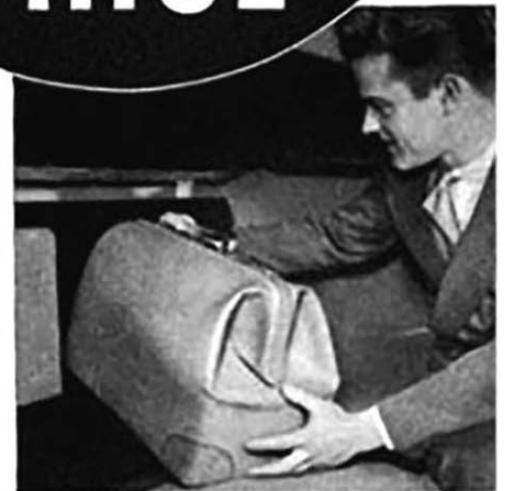
BEHIND THE REAR SEAT . . . there's a big, dust-tight luggage compartment for all your traveling needs.