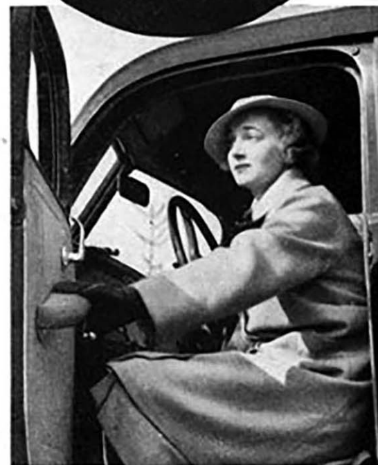
THE DOORS of the Airflow are as wide as those in a house. Both doors open at the center post for easy entrance and exit.

But as we say... words can't give you the thrill of this amazing car... you must drive it. Ask your dealer for an Airflow De Soto with the Automatic Overdrive... and watch for a miracle when the speedometer touches 45!