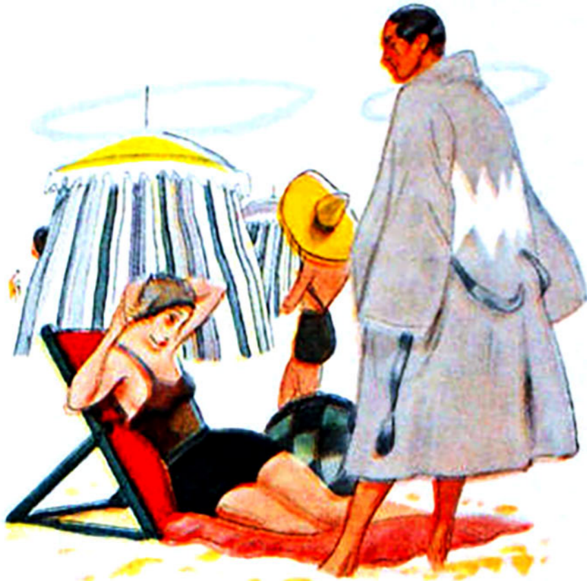
THE NATION'S SOCIAL CAPITAL moves South. And social leaders coming for rest find themselves caught in the gayest season Florida has seen since the Twenties!