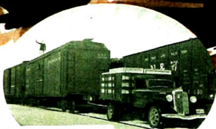
In repeated tests, a 1936 Reo 2-3 Ton Truck, equipped with the Reo Gold Crown Engine, pulled an 80-ton load without laboring! Notice the snow. A tough job that only a tough truck can perform!