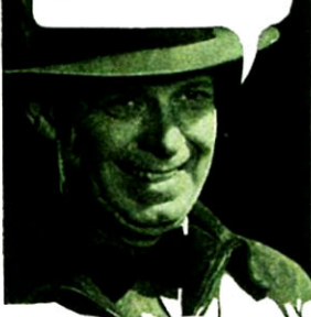
Reo Speedwagons and Trucks range from 1/4 to 4-6 tons. Prices from $445 up, chassis f.o.b. Lansing, plus tax. * 1/2-Ton Chassis f.o.b. Lansing, plus tax.

GIMME A REO TRUCK WHEN THE GOING'S TOUGH!