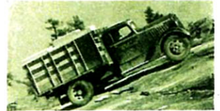
Climbing grades up to 45%! Two Reo trucks, loaded to full rated capacity, climb Stone Mountain over rocks and boulders.

All the heavy duty models of the new Reo have husky, 7-bearing crankshafts—in many, 2-Speed rear axles, 5-Speed transmissions and double-reduction axles are now available. See the new Reo Trucks for 1936 before you make any truck investment. Your nearest Reo dealer will show you how a Reo can save you plenty of money. Make it a point to call him today!