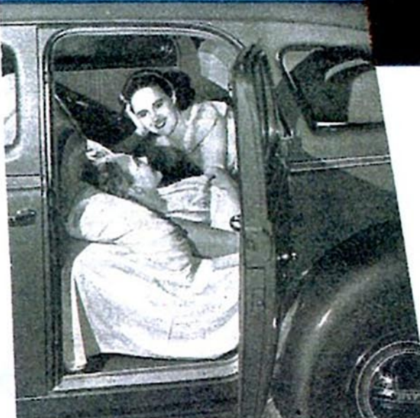
From actual photograph of Nash Ambassador Six 4-Door Sedan with trunk

In big cities and small towns all over the country . . . thousands of wide-awake people are stepping out in luxurious big Nash cars this year