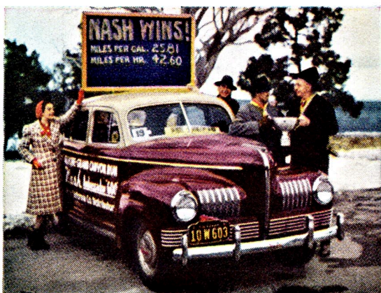
A New Record! From Los Angeles to the Grand Canyon . . . over 599 gruelling miles of desert, mountain passes . . . Nash averaged 25.81 miles a gallon at 42.6 miles an hour!

In the A. A. A. Gilmore Economy Run— the Nash Ambassador “600”, Equipped with the Marvelous Fourth Speed Forward, Officially Delivered More Miles to the Gallon than any other 6, 8, or 12 cylinder car entered, regardless of Size, Price, Weight or Equipment.