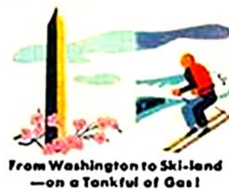
From Washington to Ski-land—on a Tankful of Gas!

3 Great Series—15 Brilliant Models Greater than ever, too, are the 1942 Nash Ambassador "6" and "8". New engine development makes them amazing performers. Still in the low- and medium-price fields!