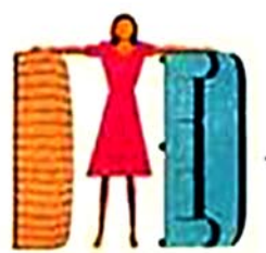
Seats Wide as Living Room Sofas!

• Come and spend just 15 minutes with this "Million Dollar Beauty". . . and see for yourself how little a mile can cost!