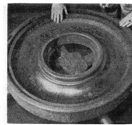
INSPECTOR checks special vulcanizing mold upon delivery to curing room.