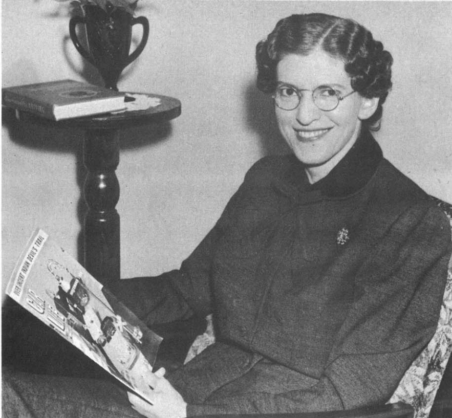
CAR LIFE's First Prize winner is a real estate operator and insurance agent in Eldora, a town of 3,000. Her victory came as a thrill and a surprise, she says.