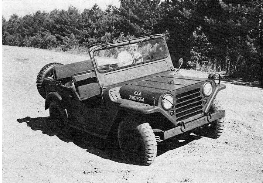
DETROIT, MICHIGAN —A preview of the new look in military vehicles was exhibited recently, when an experimental quarter-ton utility vehicle, the Ford XM-151, was delivered to the Army Ordnance Corps. It began when Ford was asked to design a vehicle which would weigh less and cost less to produce yet have improved mobility, performance and easier maintenance than previous models. The prototype was delivered, at elaborate ceremonies, with a curb weight 600 pounds less than existing models but with 30 percent more cruising range with the same fuel load. Powered by a promising new ohv 4 cylinder engine, which should have many civilian uses, the car features a new version of the "swing axle" which is interchangeable front to rear and left to right.