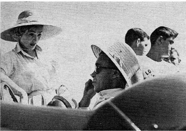
SANTA BARBARA, CALIFORNIA —The second annual running of the Santa Barbara Road Race proved to be a tremendous attention-getter. Excitement ran high as cars and drivers' names were listed. The public was very interested in one name: Porfirio Rubirosa, internationally known diplomat and sportsman. Scheduled to appear with a new, streamlined Ferrari "Mondial," Rubirosa also appeared with better-known Zsa Zsa Gabor.