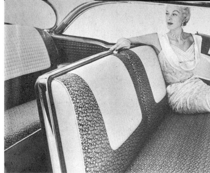
The outstanding beauty of Buick interiors is exemplified in the two-door Roadmaster Riviera which features a gold floral design on a black, green or blue nylon background.