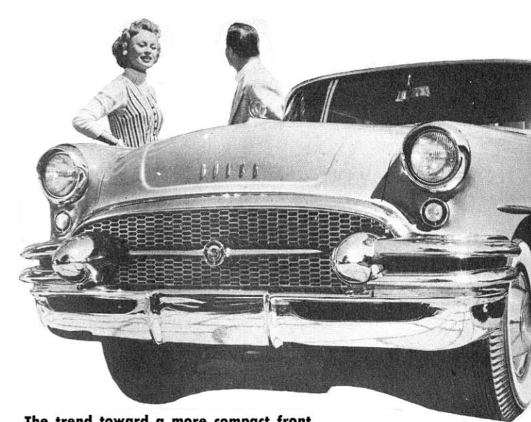
The trend toward a more compact front end appearance is shown by Buick with a recessed hood and wide-screen grille.