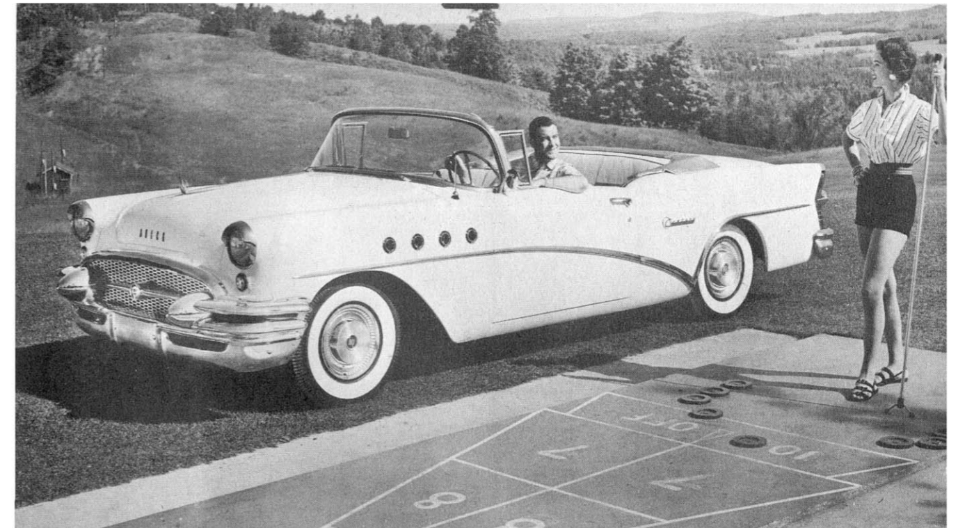
Power is the word for the Buick Century and the Century Convertible offers style leadership as well. Its 236-hp. engine, variable pitch transmission and a 9.0 to 1 compression ratio give the Century high performance in the medium-price field.

Improved power steering is standard equipment on the Roadmaster and Super, and optional on all other models. Previously, power steering was standard on the Roadmaster only.