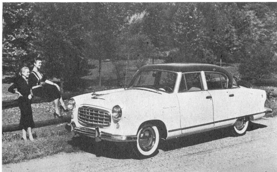
Rambler four-door Sedan offers ample room for six passengers and large luggage compartment. Tubeless tires are standard equipment on all new Rambler models.

An entire range of eleven solid and eleven two-tone exterior baked enamel colors are available. All 1955 models are equipped with the new tubeless super-cushion tires as standard equipment.