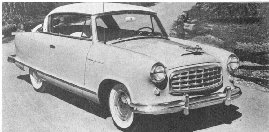
The Rambler Country Club, on a 100-inch wheelbase, features modern styling, improved front suspension and a new grille. Unique reverse-angle rear windows afford greater visibility.