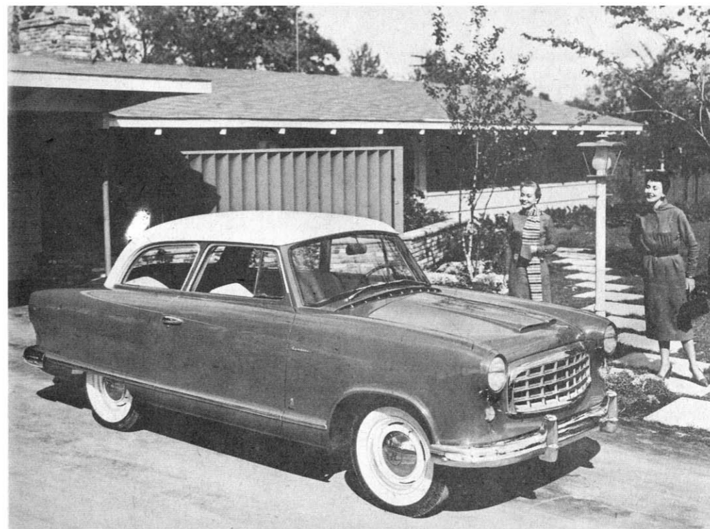
The Rambler Club Sedan is the line's lowest priced model. It features a large rear window, curved one-piece windshield and large side windows to provide panoramic visibility.