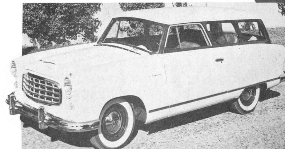
Suburban station offers ample space for both cargo and passengers. With the rear seat lowered, the cargo platform extends more than six feet. It has wheelbase of 100 inches.