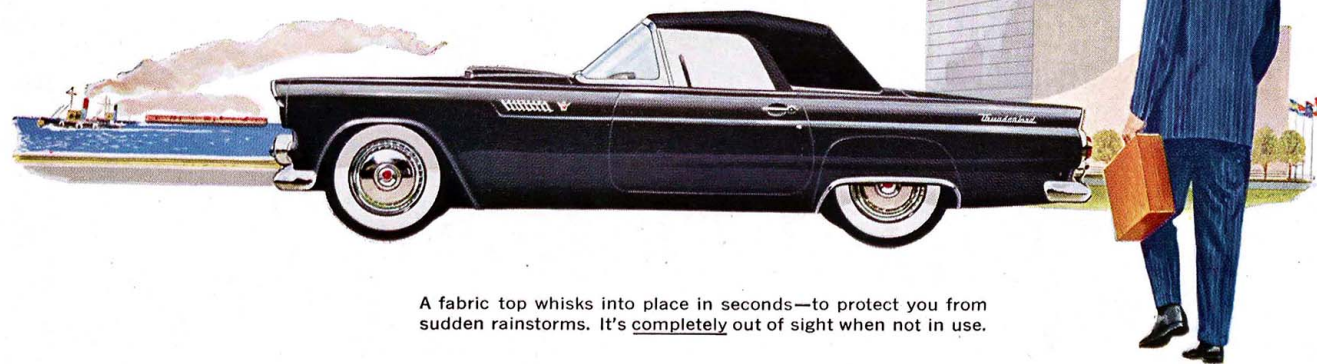
A fabric top whisks into place in seconds—to protect you from sudden rainstorms. It's completely out of sight when not in use.

Will it be the liveliest, swiftest American sports car of all? Will it hug the road and corner with the best? Will it provide conveniences and all-weather protection far beyond the usual?