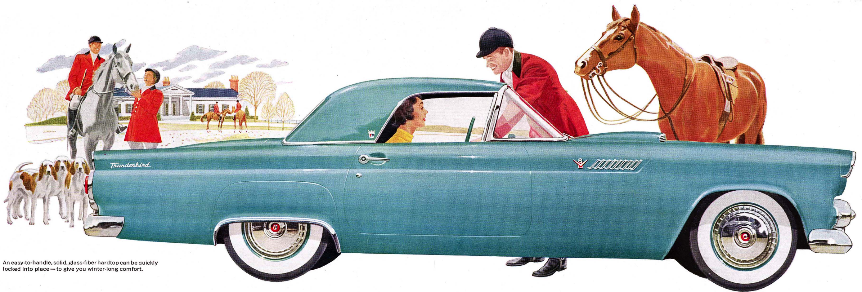
An easy-to-handle, solid, glass-fiber hardtop can be quickly locked into place—to give you winter-long comfort.