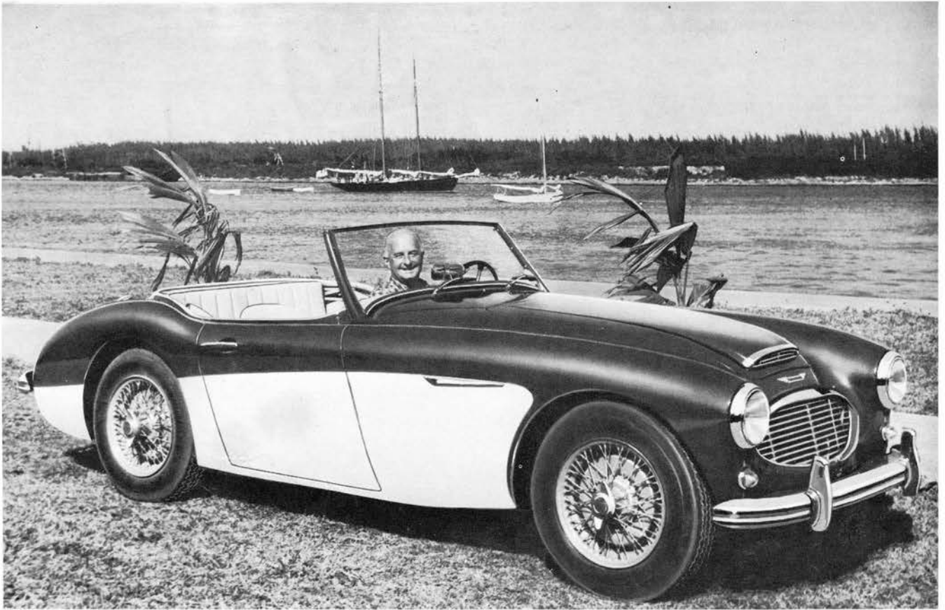
Designer Donald Healey at the wheel of the new 100-Six in Nassau