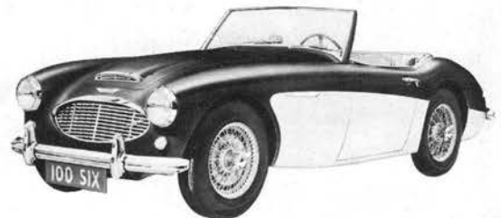
Specifications available upon request

Represented in the United States by hambro AUTOMOTIVE CORPORATION 27 W. 57th Street, New York 19, N.Y.