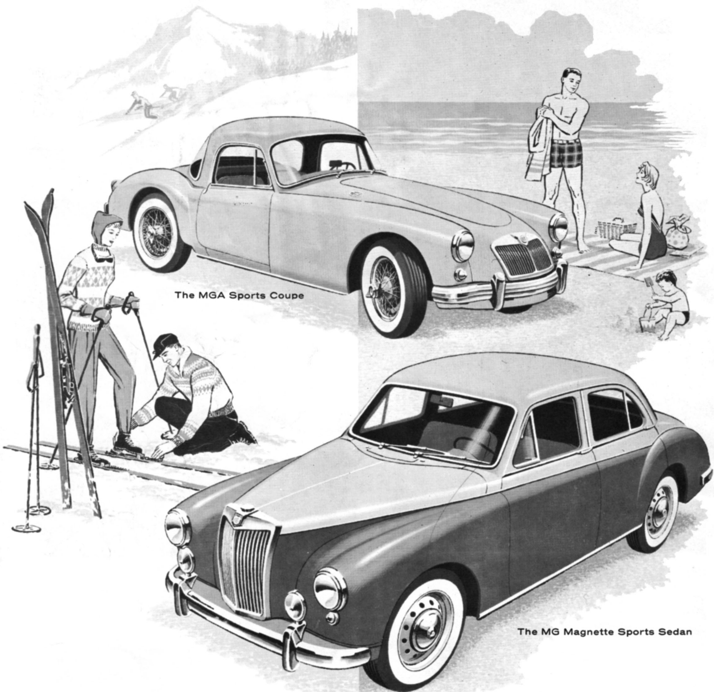
The MGA Sports Coupe