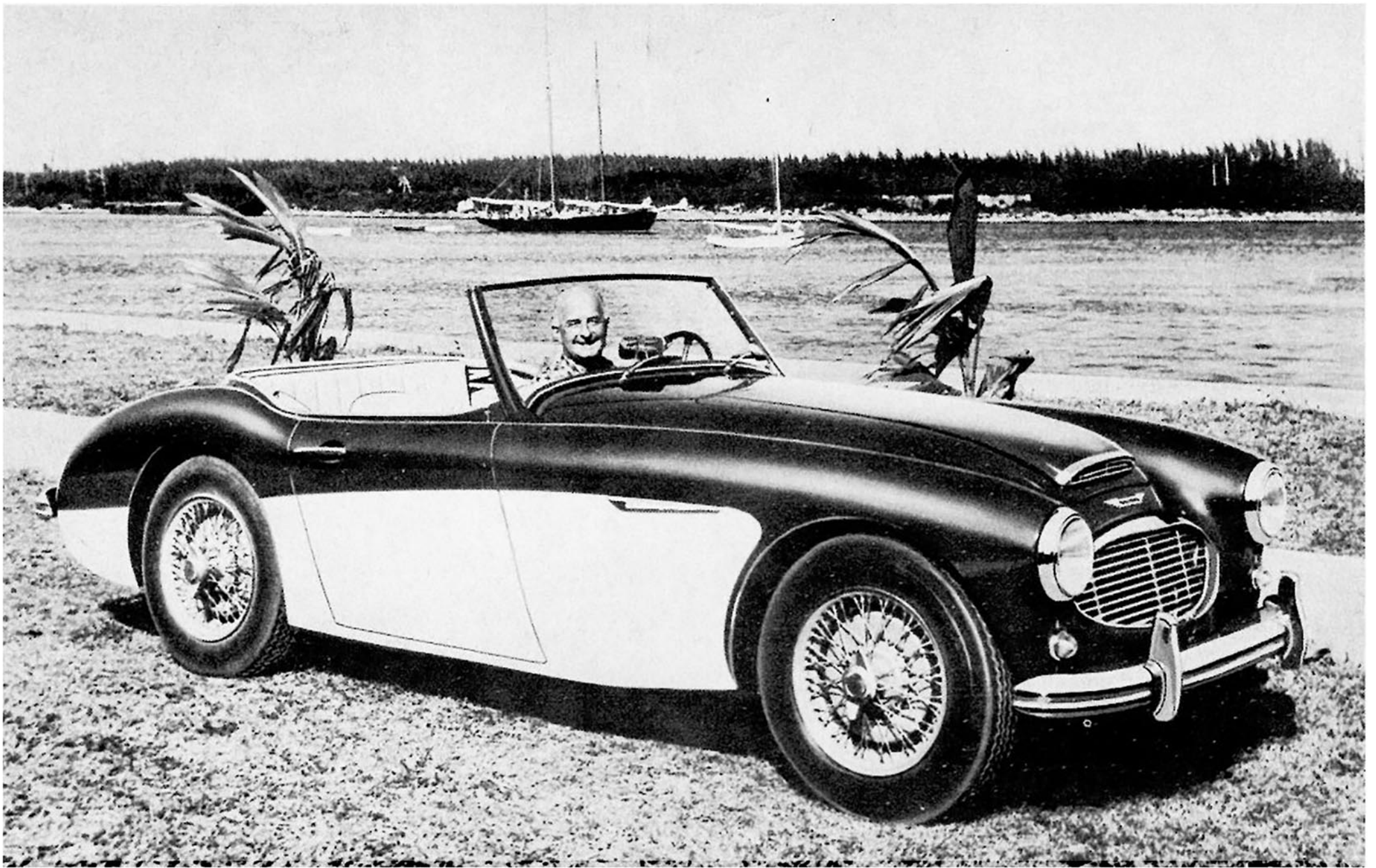
Designer Donald Healey at the wheel of the new 100-Six in Nassau