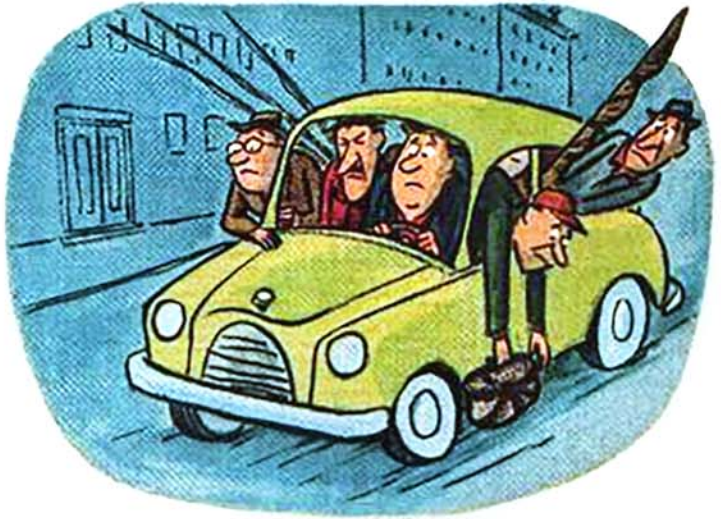
So he looked at an economical little foreign car. But it wouldn't hold a tent, ten fishing rods, and five boon companions.