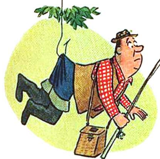
There was this ardent fisherman who went car-shopping. He saw a great big dreamboat and went for it—hook, line and sinker.