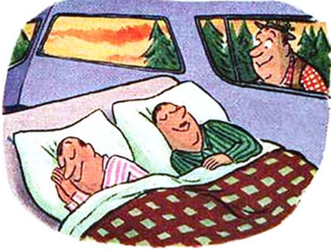
He saw Airliner Reclining Seats, Twin Travel Beds, and the lowest-cost air conditioning. He heard about Rambler's proven fuel economy.