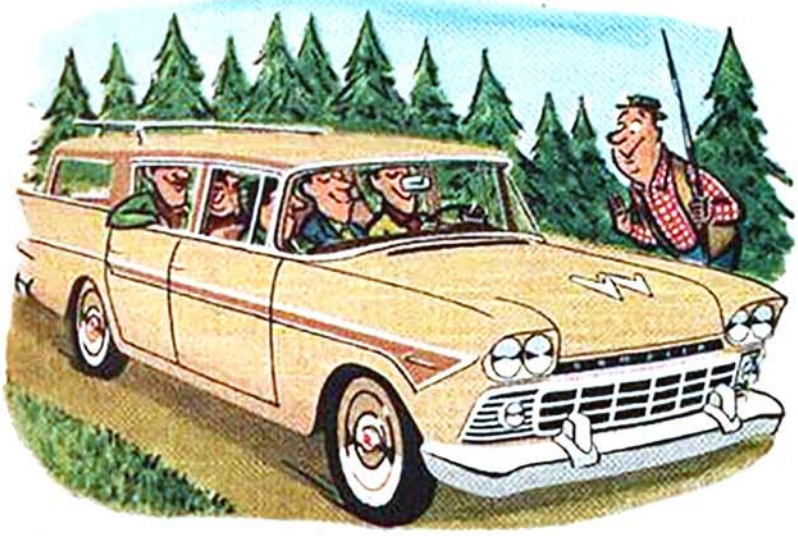
Then he looked at the new '58 Rambler, saw jet stream styling, Pushbutton driving, and room for six tall fishermen with their waders on.