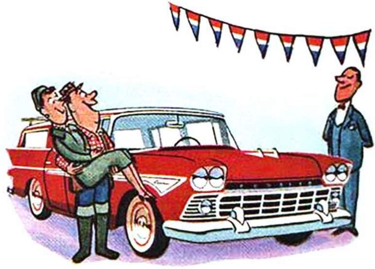
"I'll take the new '58 Rambler Economy 6," said he. "But reserve one of those new Rambler Rebel V-8's for my wife. She's tired of being a fishing widow."