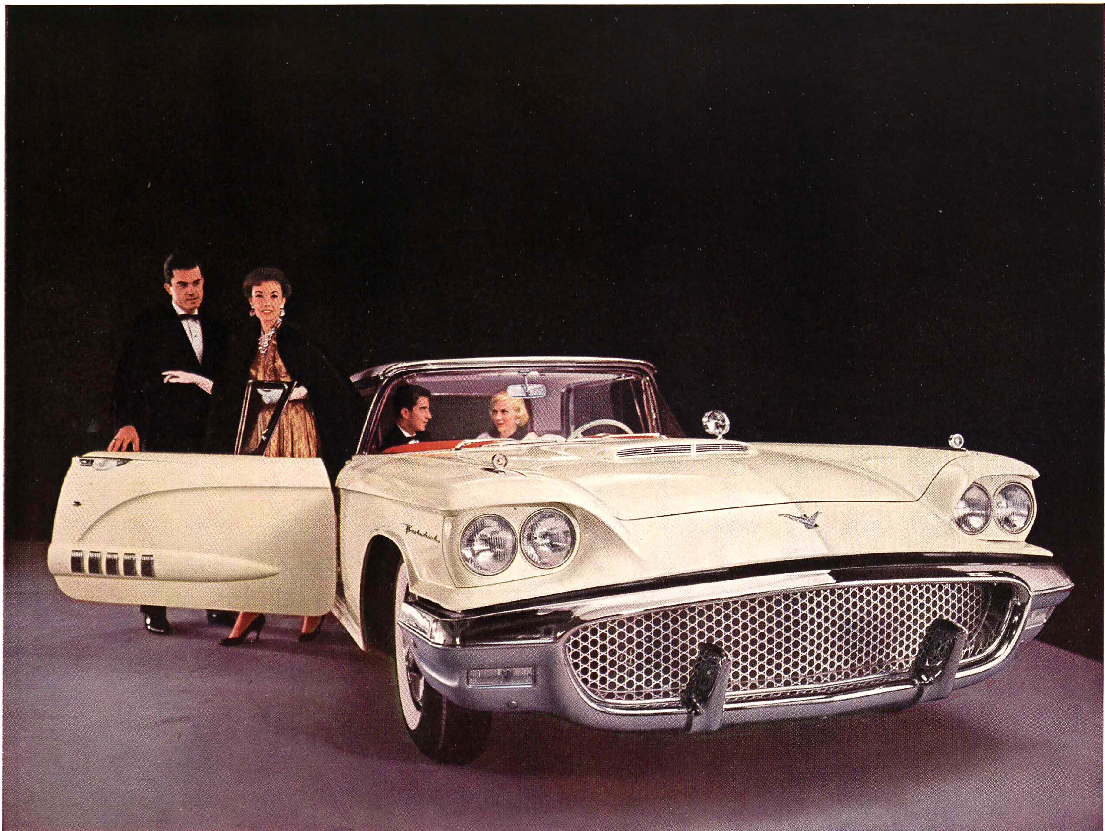
GRAND ENTRANCE GOWNS BY RUTH JOYCE