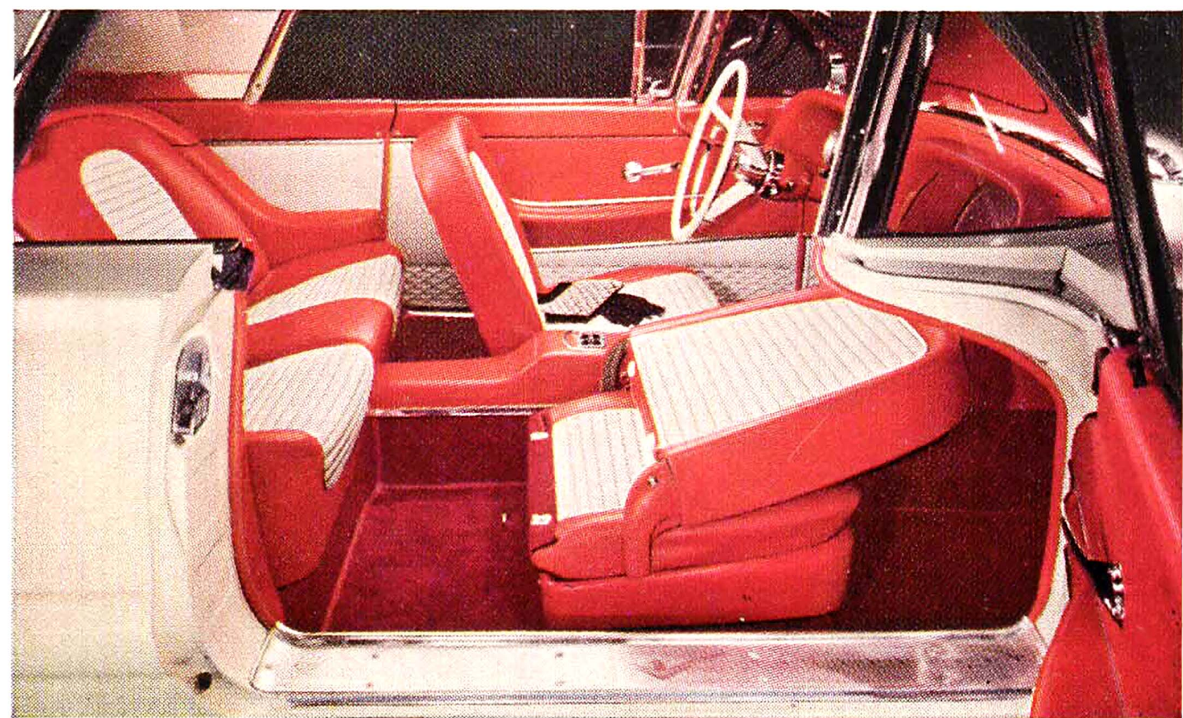
Spacious glide-through doors give you direct access to all four seats. You enter and exit with your clothes unruffled and poise intact!

Every inch of the new Thunderbird was designed with a woman in mind—the grace with which it responds to your white-glove touch—the new, spacious luggage compartment, the “coffee-table” console. How America's most individual car becomes you! Delightful surprise: The new Thunderbird is priced far below other luxury cars!