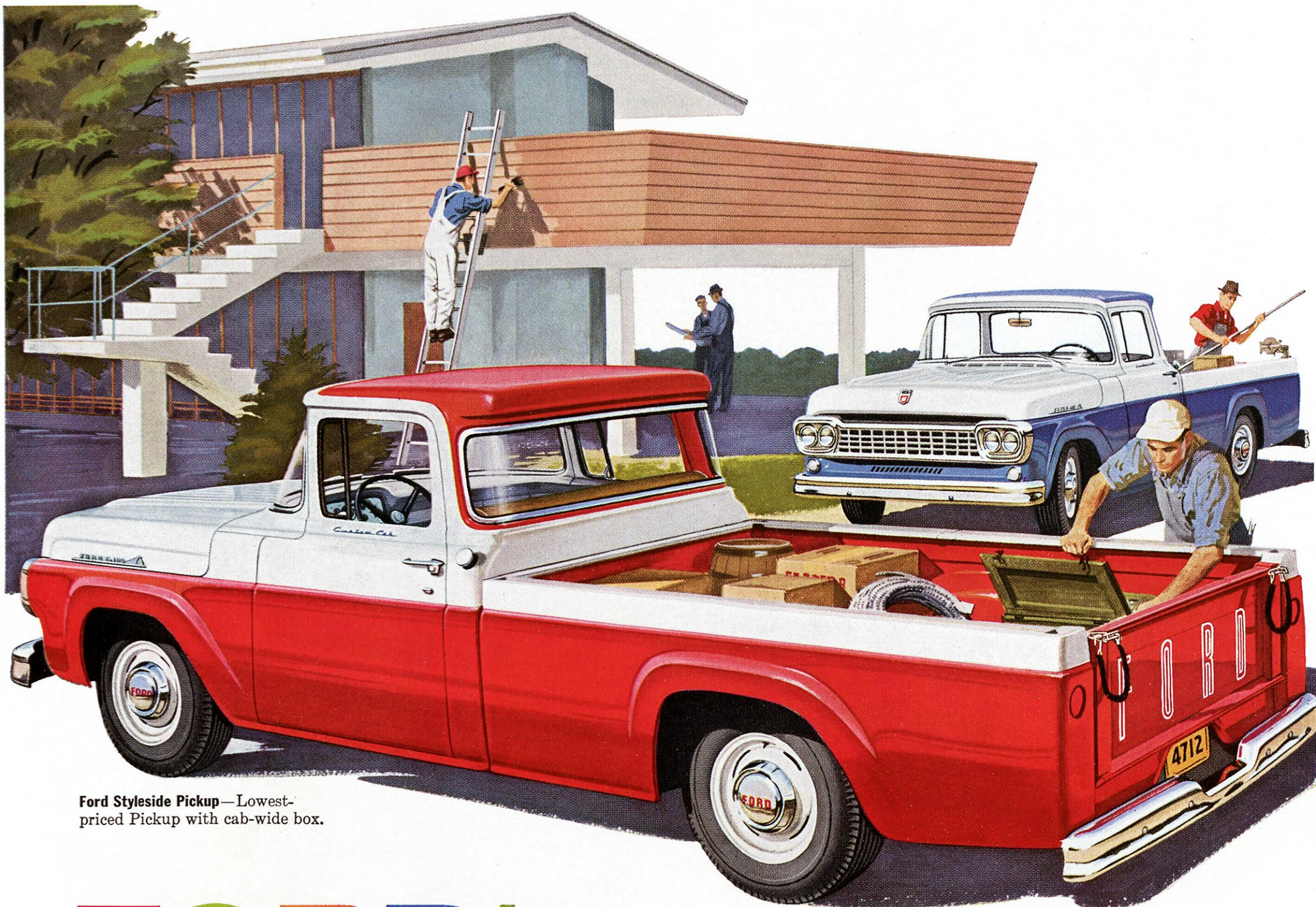
Ford Styleside Pickup—Lowest-priced Pickup with cab-wide box.