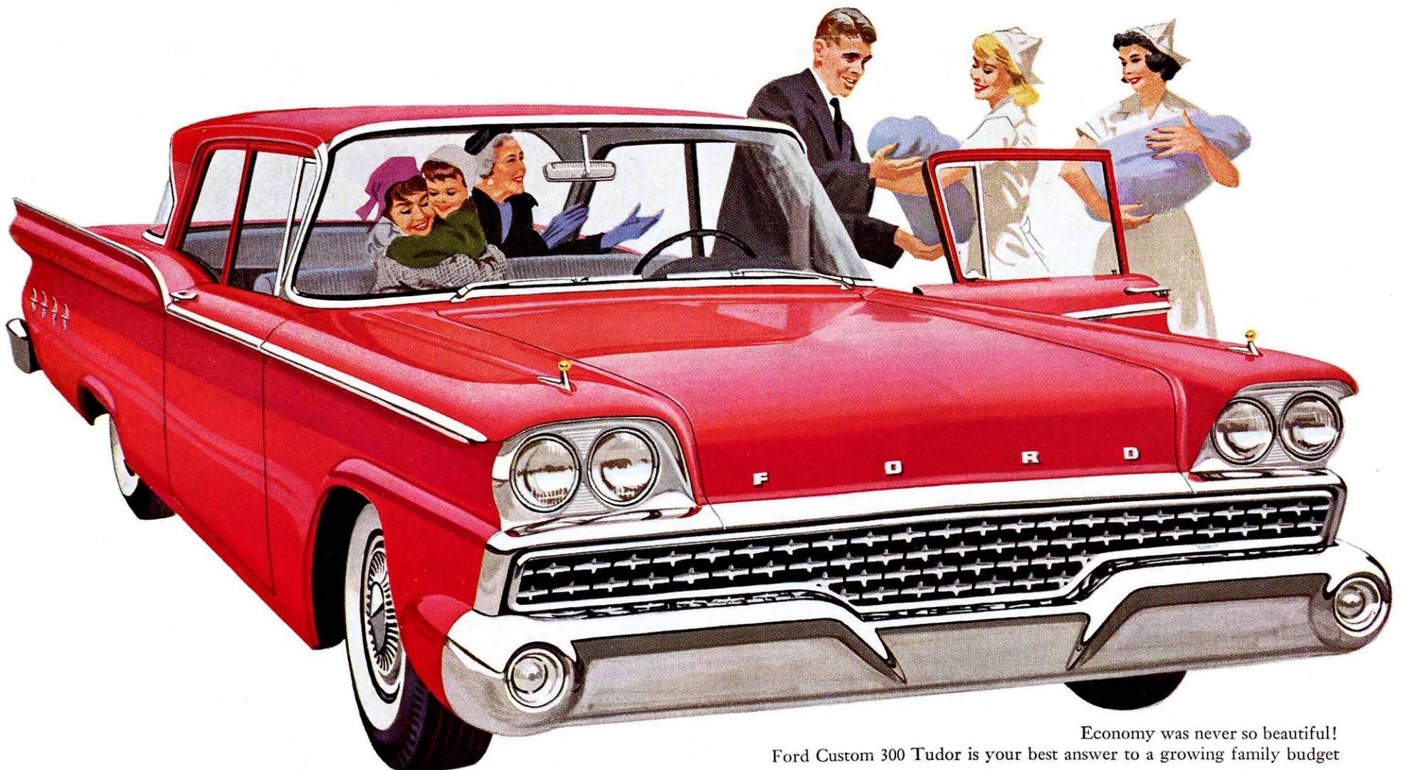
Economy was never so beautiful! Ford Custom 300 Tudor is your best answer to a growing family budget

The beautiful proportions in the 59 Ford are matched by beautiful savings. Start with the price. The 59 Ford is priced lower in all comparable models than its major competitors! Furthermore, you save up to five cents a gallon or one dollar a tankful on gas with Ford's standard Thunderbird V-8 or Six—which use regular gas! Full-flow oil filtration means oil savings. You change oil only every 4000 miles. And it's standard on all Fords at no extra cost. And waxing your car just isn't necessary, ever , with Ford's beautiful amazing new Diamond Lustre Finish! For more about Ford savings, see your Ford Dealer.