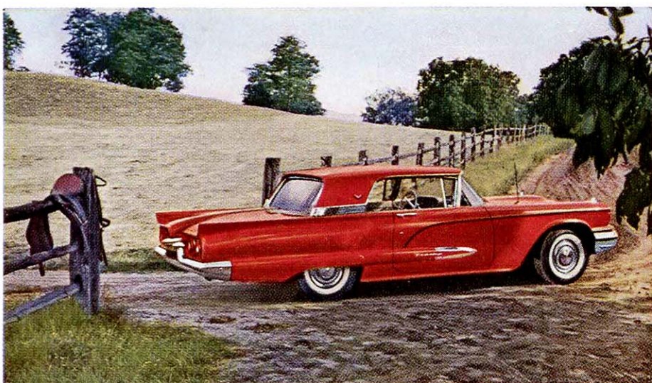
There's a lot of Thunderbird in every 59 Ford . . . in the way it's styled . . . in the way it moves . . . in the proud way you'll sit at the wheel.

The smart set are people who have discovered that the 59 Ford—the car that was awarded the Gold Medal for its elegant lines at Brussels—has big savings news, too! A filtering system that means less oil changes—every 4,000 miles instead of 1,000 often recommended. New Ford mufflers are aluminized to normally last twice as long as conventional types used on other cars. New exclusive Diamond Lustre Finish is so durable you won't have to wax it— ever!