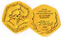
The 59 Fords awarded the Gold Medal of the Comité Français de L'Elégance for beautiful proportions at the Brussels World's Fair