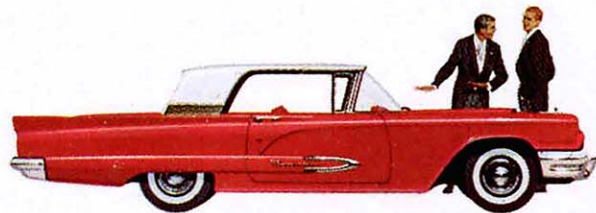
4-passenger Thunderbird — the car everyone would love to own!

straight-line Galaxie roof and dramatic see-it-all rear window. It is Thunderbird in luxury — with deep-pile carpets and the tailored elegance of specially quilted and pleated fabrics. And Galaxie has Thunderbird V-8 power , too. See Galaxie at your dealer's now — the car that's Thunderbird in everything except its much lower price!