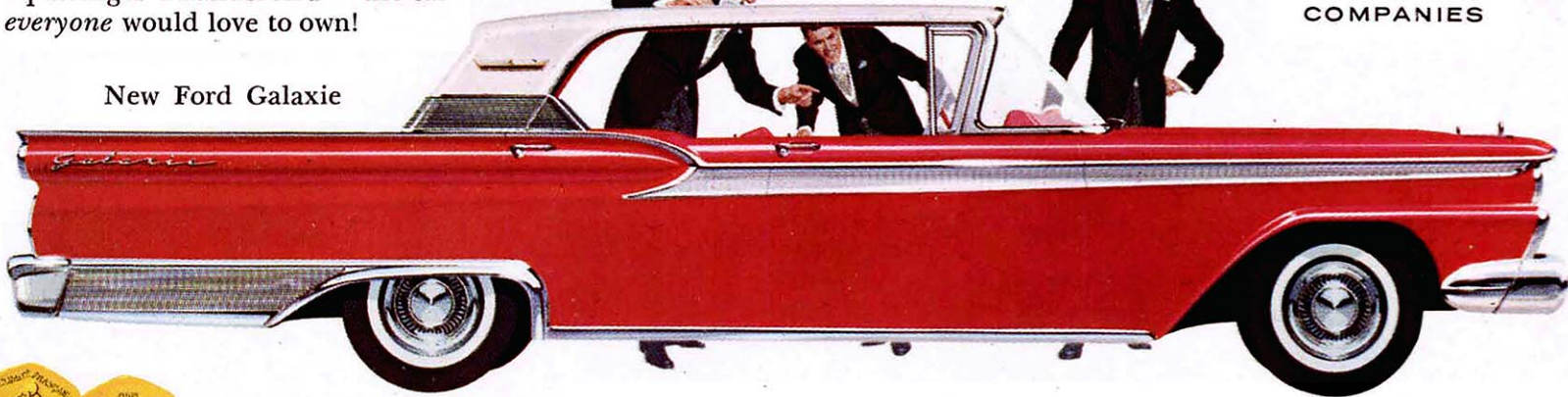
New Ford Galaxie