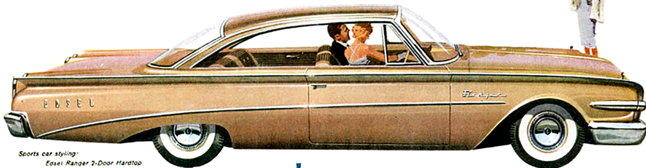
Sports car styling: Edsel Ranger 2-Door Hardtop