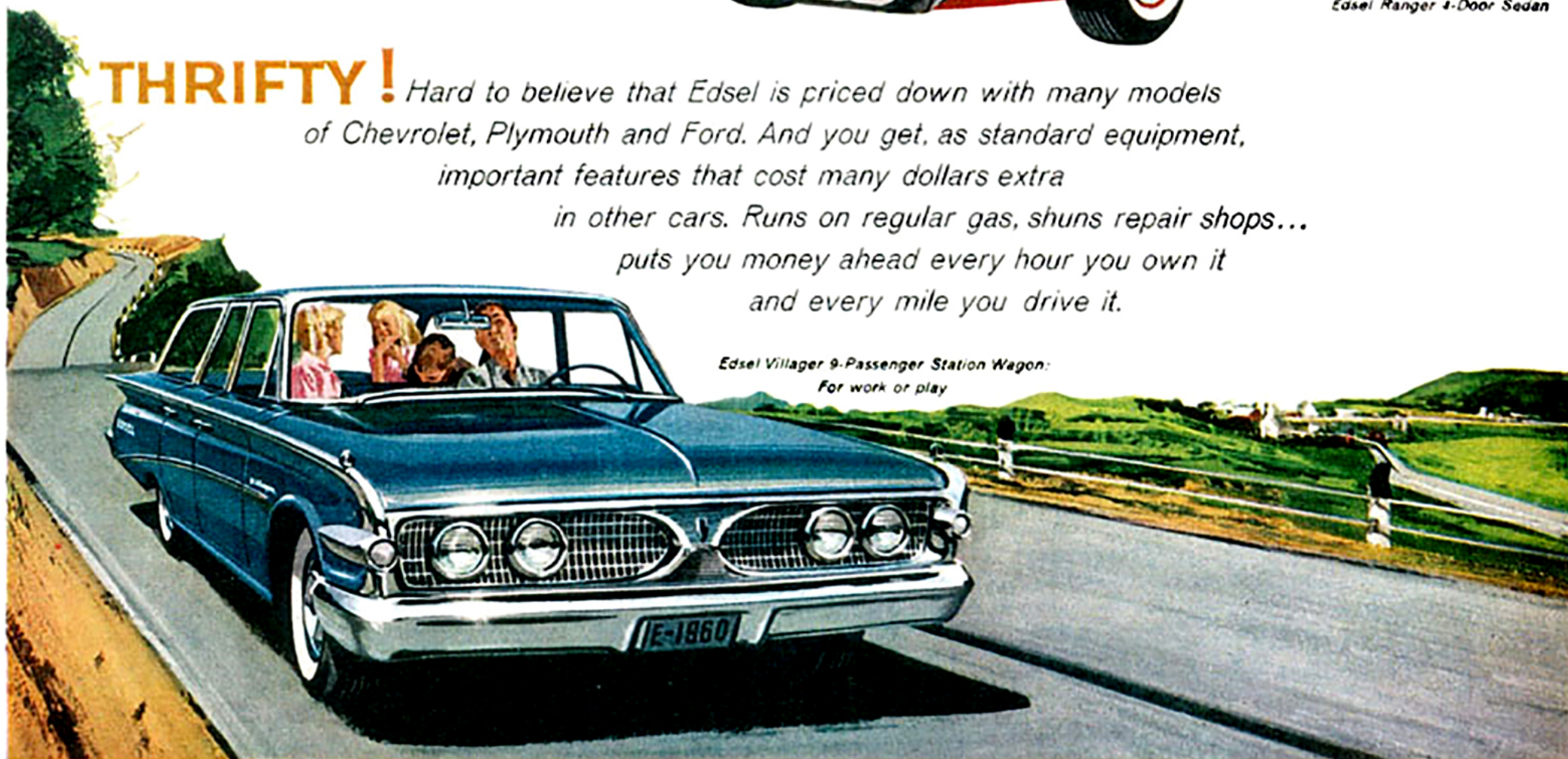
Edsel Villager 9-Passenger Station Wagon: For work or play

NOBODY GIVES YOU STYLE AND SAVINGS THE WAY EDSEL DOES