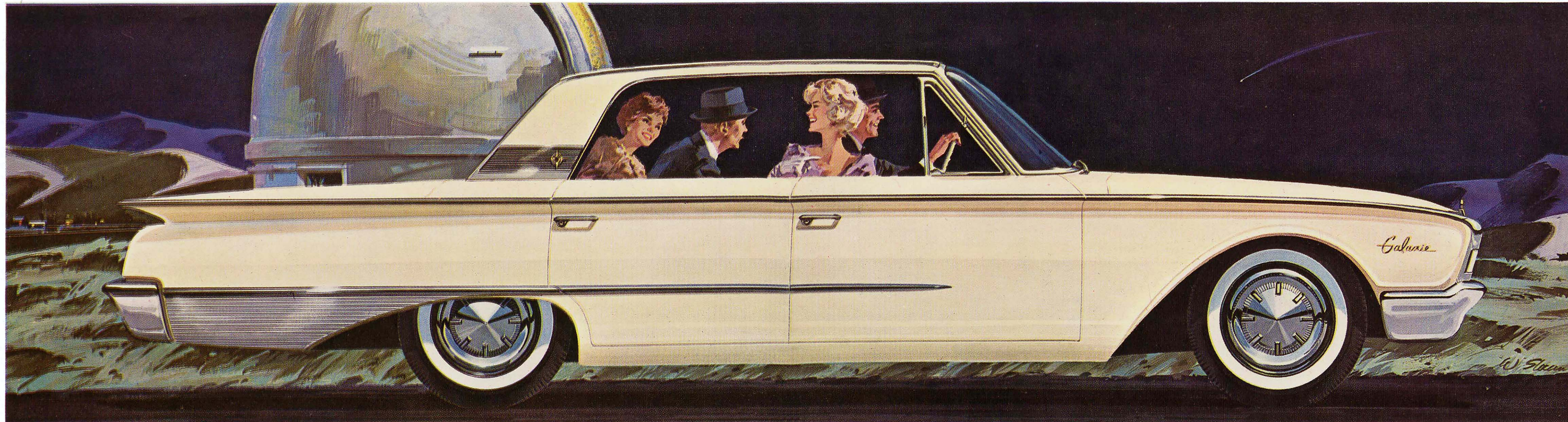
Galaxie Town Victoria — Fine example of the Finest Fords of a Lifetime