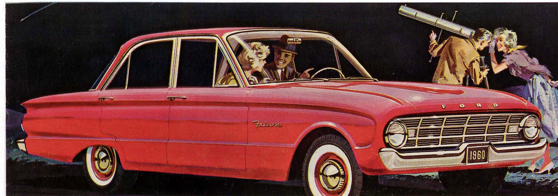
Introducing the Falcon — Ford's new International-Class car. This new kind of a car from Ford of the U.S. ... gives you six-passenger, big-car comfort, performance and safety for highway driving, wrapped up in an economy-sized package!

Whatever your tastes and needs, there is a Ford for you . See them today.