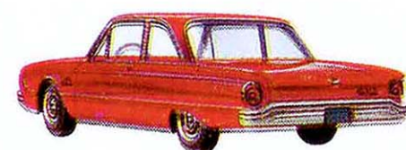
New Ford Falcon: Two-Door Sedan