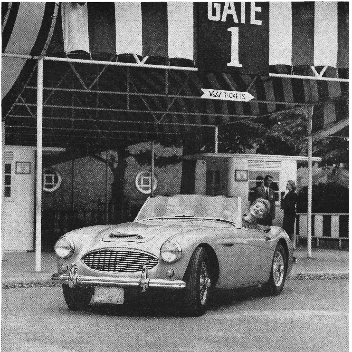
The Austin Healey '3000'

ODDS-ON FAVORITE. The sky's clear, the air's like wine. You're ready for fun, and ready to go. And so is this spirited performer. The Austin Healey '3000' is the fabulous successor to the famous Austin Healey 100-Six which has dominated competition in its class. The '3000' hugs corners, clings to the road with sure-footed assurance. Has speed in reserve for a straight-away 115 m.p.h. Disc brakes bring it to a smooth, straight-line stop. Take this beauty out on the road, and you're really living. For as low as $3051 p.o.e. (2 or 4 seater).