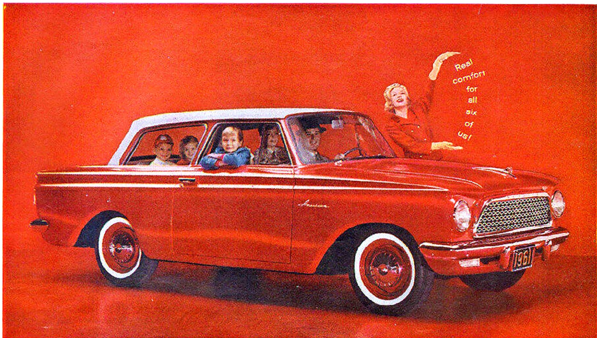
Beautiful new Rambler American Deluxe 2 Door Sedan, above, is America's lowest priced car.